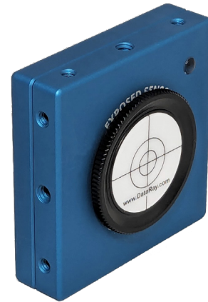
BladeCam2 1.8 x 1.8 x 0.5 in 46.0 x 46.0 x 12.8 mm

The BladeCam2™ is paired with DataRay's full-featured, highly customizable, user-centric software which has unlimited installations, free software updates, and no license fees. It is perfect for applications including CW laser profiling, field servicing of laser systems, optical assembly, instrument alignment, beam wander and logging, R&D, OEM integration, quality control, and M 2 measurement with available M2DU stage.